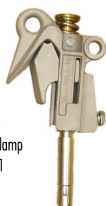
conductor clamp 816.001