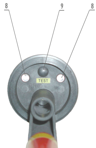
Contact electrode 3.6 - 38.5kV